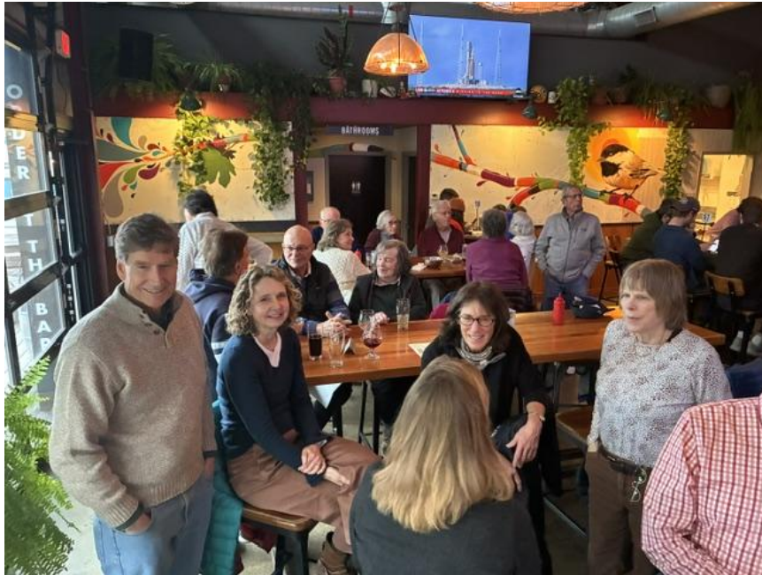
Cruising Pub Night.