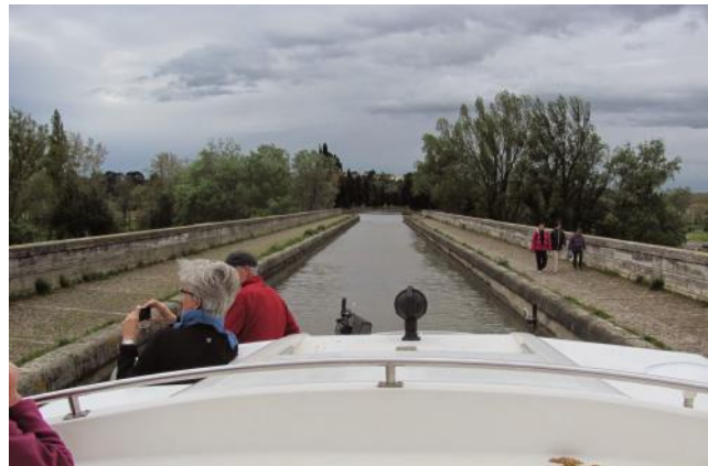
Passing over the aqueduct.

We started near Beziers, a short distance from the Mediterranean. Provisioning consisted primarily of loading up with three flavors of sangria in recycled Evian water bottles. On-site training consisted of learning a