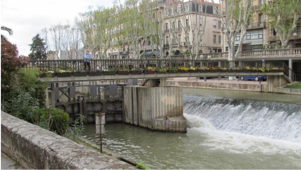
The Canal passes through the heart of Narbonne.

It did not take us long to realize that the city life was not for us and so it was back to the canal. Day after day we would pass through small towns. Sometimes we would tie up for a meal or a snack or the night and others we would simply motor on.