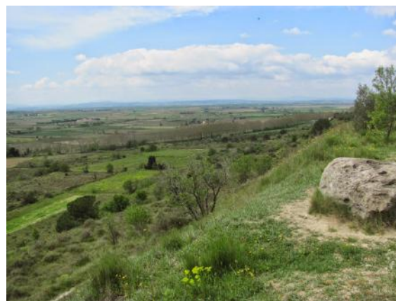
The view from the top.

the rail line that runs underneath the canal at this point. That is shown in the photo of the model above. The other photo is of us standing on top of the canal tunnel on top of the train tunnel below.