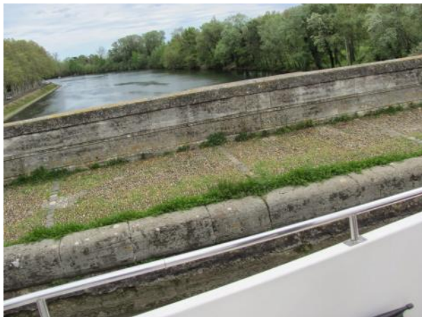
View of river below, from out boat.

three point turn, which interestingly involved turning the bow of the boat into the canal bank and swinging the stern around.