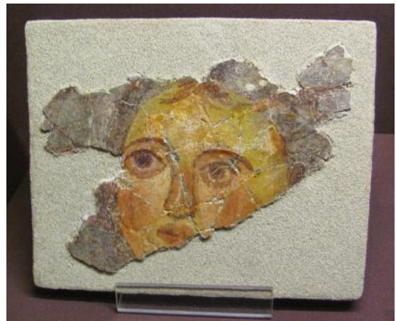
A Roman Mosaic.