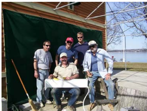
The Kiosk crew in action.....