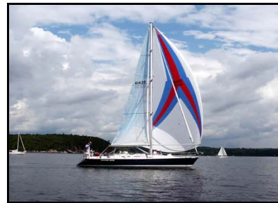
New Boat .....the Toensing's Southern Cross

Over the years the club has lost/skipped four mooring positions. These were recently reinstalled to maintain our approved mooring numbers for members/guest spots.