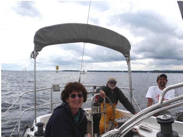
Crew of Secrets -Ladies' Cup