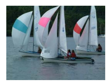
FJ's in close duel under spinnaker at the inter-club regatta at LCYC.