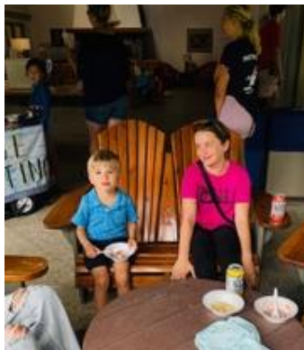
Ice Cream Sundaes