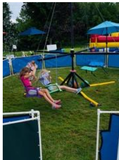
Blue Trunk games and