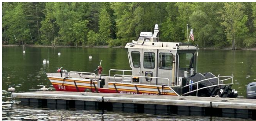
Shelburne Fire Department Fire Boat.

As you may have noticed, we have a new guest at the work dock. The Shelburne Fire Department requested permission to use the south side for their Fire Boat. After extensive discussions, an agreement was executed for a one-year trial. They are very happy to reduce their travel time to the Bay as they had previously docked at Safe Harbor Shelburne. This arrangement is consistent with our Lake Encroachment Permit in serving a public good.