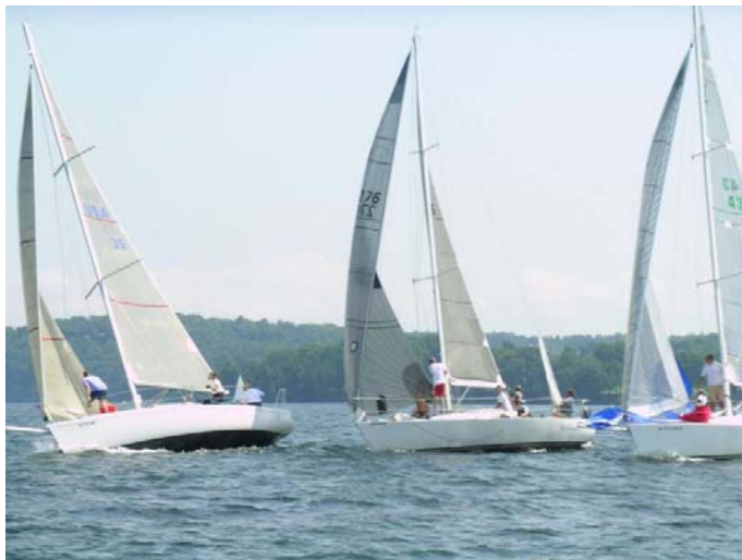
Close to the Action Part I: Ladies Cup