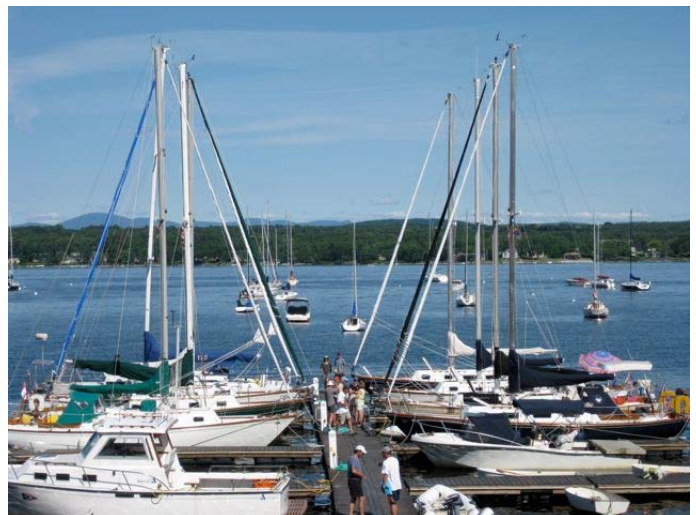
Tartan 34 C's Take Over the LCYC Docks