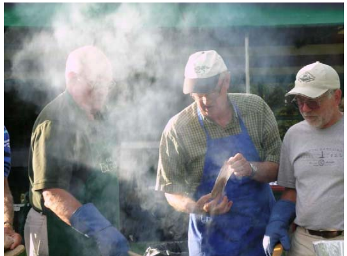
Close to the Action Part II: Burger Burn