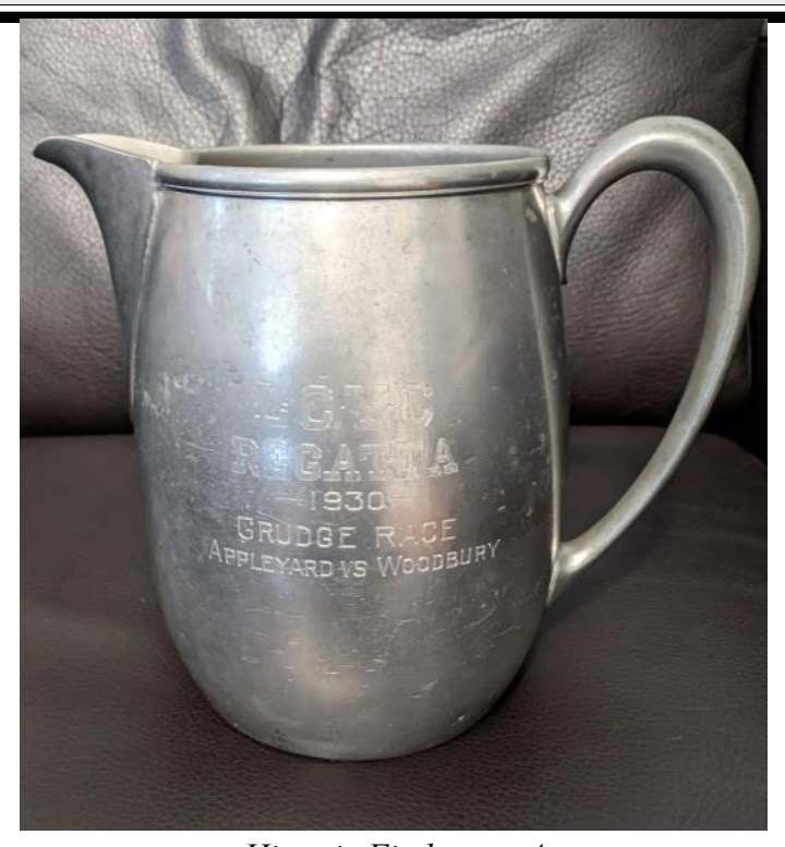
Historic Find, page 4