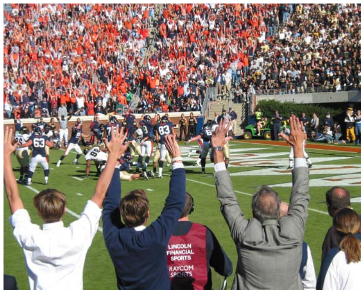
All hands up tells it all as UVa beats Wake in the closing minutes of a perfect afternoon in Charlottesville.

We woke up the next morning just in time to get to the game, which started at noon. It was a perfect day to go to a college football game, and while I had tried to cut corners on almost every expense for the trip, the tickets themselves were the one exception. We sat in the first row, on the 10 yard line. Nobody but the players had a better view of UVa's winning drive in the final two minutes of the game. It was awesome - like we were in front of a parade of 60 thousand screaming lunatics, and we were the head bull goose loonies. We left the game and drove Skyline Drive until sunset, another remarkable experience that should be on everyone's life checklist. All in all, it was about as much fun as a human being can have (on land, that is!)