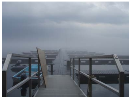
At the close of workday, after the rains, an eerie fog developed in Shelburne Bay. Just 100 yards off the dock, Pied Piper is barely visible.