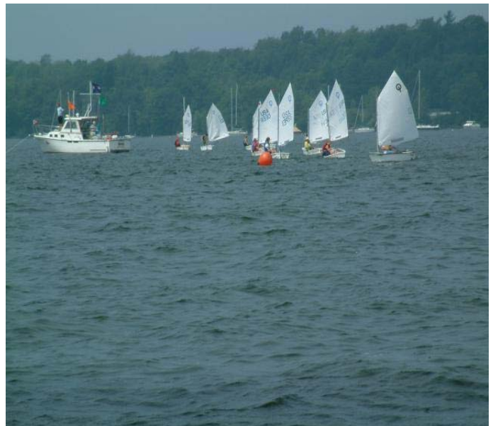
Junior Sailors Getting a Start in Optis