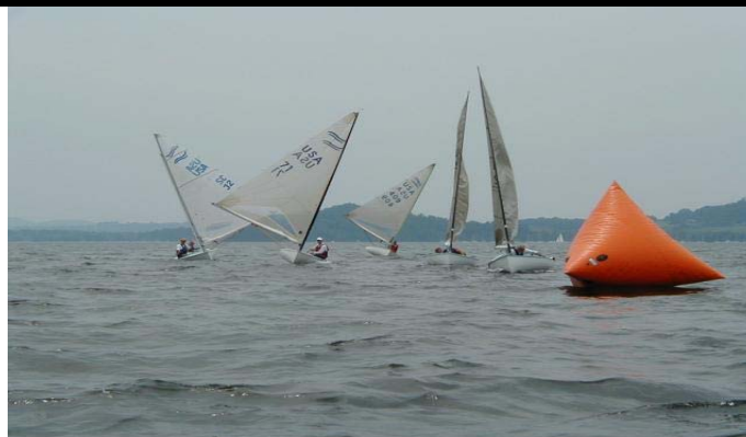
Action from the 2006 Finn Regatta

At times its been frustrating, but more often its been exhilarating. In addition to the regular Wednesday night and weekend racing, there have been social gatherings and even a spectacular air show put on by the Vermont Air National Guard. Many club members viewed the air show festivities by land, others by sea. Either way it was awesome! Here are some of the many views on a wonderful summer.