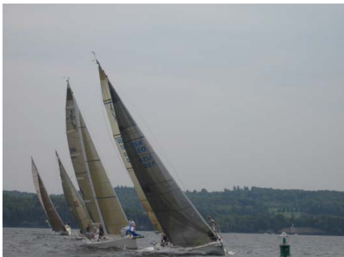
Action from the 2006 Odziozo Race