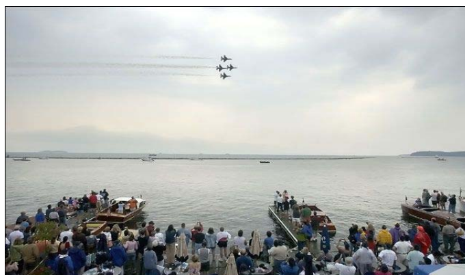
A Supersonic Fly-By As Seen from the BTV Waterfront