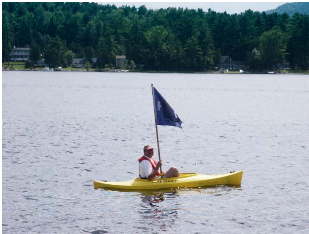
Champagne Race Committee on Station Willsboro Bay, NY