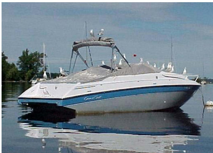
(Ed. Note: Distant Thunder left her mooring after this was submitted. The flock moved to end of LCYC's main dock presumably to be certain the guardian owl wouldn't be alone out there in the cold...)

Or is the entire gull population of the Champlain Valley simply expressing an opinion...? You decide.