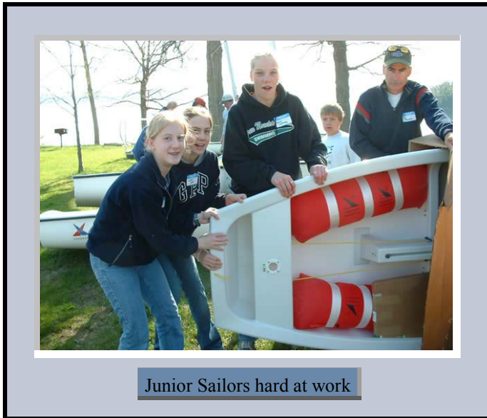
Junior Sailors hard at work