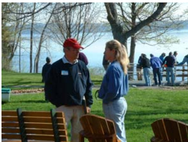
The Commodore steadfastly ignores the struggling Gangway Gang in the background. (Is this guy good for anything? )