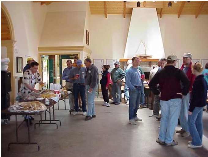
At the end of the morning's work, everyone enjoyed the traditional chili-and-cornbread lunch by St. Pierre's Catering.